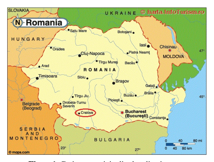
Figure 1. Craiova municipality localization

Accordingly, the present research analyses the potential of tourism development in Romania's 6<sup>th</sup> important city - Craiova municipality – (fig.1), aiming at highlighting the specificities of cultural tourism, especially the potential that green spaces hold and the tourists they may attract.