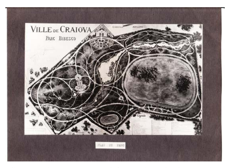
Figure 6. 1900 Bibescu Park (Romanescu Park former denomination) Landscape Planning

Paris. It is one of the largest and most beautiful parks of Romania, and one of the few parks in Europe that preserves the romantic composition style it was designed in.