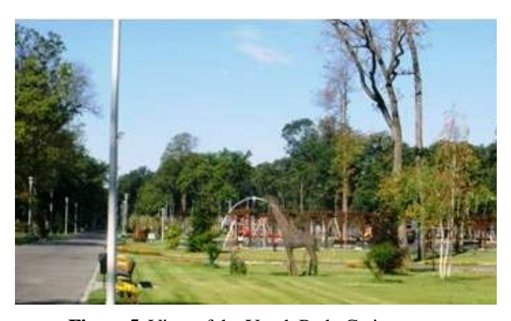
Figure 5. View of the Youth Park, Craiova

The Youth Park (57ha) replaced the old, derelict and obsolete leisure area of Lunca Jiului (Jiu's Meadow). Planned by Eduard Redont, but located in the south-western periphery of Craiova, this park was initially conceived as an urban forest. Starting from 1990, however, the area was settled by gypsies and socially stigmatized and even avoided ethnic groups. As a stage of urban reshaping and revival of the district in which it is located, it was rebuilt and opened in 2009. Now it provides children playgrounds equipped with modern urban furniture, sports grounds. But the transformation of this park is indeed remarkable, due to its landscape planning, fountains and many topiary figures (fig.5). It thus fulfils the two functions of relaxation and touristic attractiveness.