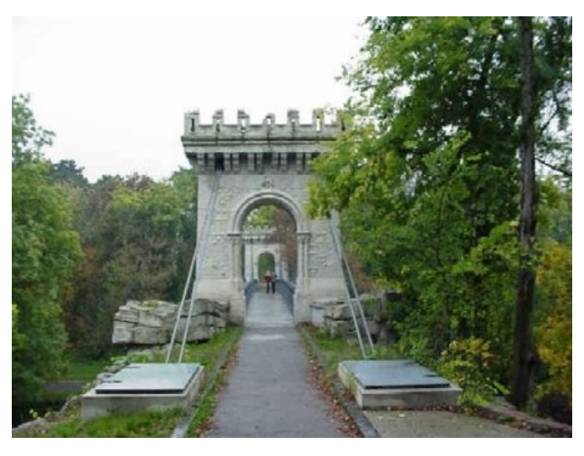
Figure 7. The suspended bridge and the castle of N. Romanescu Park

Nowadays, out of the 96 ha total surface area of the park, 90 ha are occupied by vegetation, 4 ha by a system of lakes, the rest being occupied by a hippodrome, a velodrome, a wharf and a small zoological garden. The romantic buildings that are integrated to the park and that spotlight its romantic style are: a medieval castle, rocky groupings, rustic bridges and a suspension bridge (fig.7). A series of waterfalls connects the lakes, creating a complex hydrographical system which combines vegetation elements on the islands, hydrographical diversity and a varied fauna. It may be considered a heritage garden according to the Florence Charter and labelled as such, but for the inhabitants as for the tourists it is a "remarkable park".