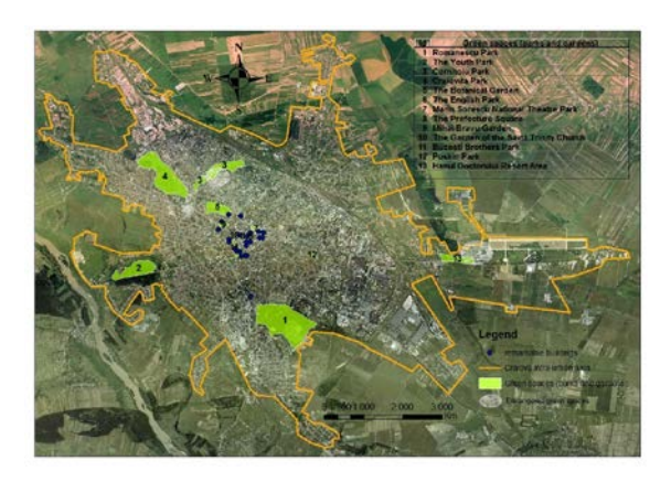
Figure 3. The territorial disposal of green spaces in the Craiova municipality

It is obvious that not all the green spaces of a city are remarkable and thus visited as such by tourists with the same motivation. The green spaces of the city centre, usually squares, fulfill the function of an "oxygen pump" within a mineral environment of concrete buildings. Such green spaces, even if not remarkable are much frequented because they are located in the neighborhood of touristic sights and offer a suitable place of relaxation. In the case of Craiova municipality, there are green spaces situated in the city centre which fulfil such a function (fig.3).