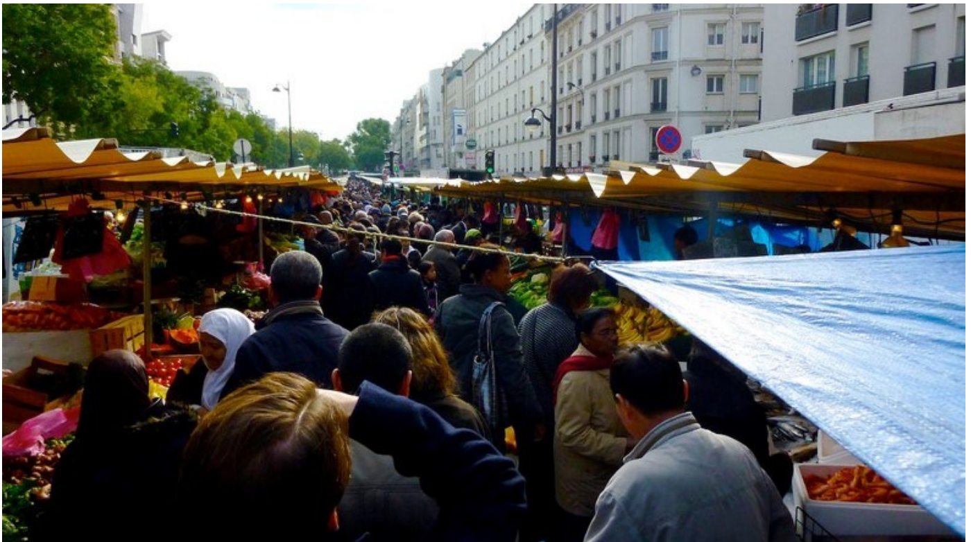
Figure 7. The Marché de Belleville. Market interactions enable vendors and customers to narrate migration stories and collectively construct narratives of belonging

The multicultural negotiations unfolding within Belleville's markets and restaurants extend outward into the neighborhood's visual landscape, where street art demonstrates how public walls become canvases for political expressions that connect local and transnational concerns. On a wall adjacent to the Ménilmontant Market (also known as the Exotic Marché Belleville), two murals appeared side by side: one declaring "Sudan in Revolt," the other proclaiming in French-English code-switching, "Chômeuse go on" (Figure 9). The latter phrase, combining the French feminine noun for "unemployed woman" with the English exhortation "go on," exemplifies how linguistic hybridity registers both gendered unemployment and broader languages of working-class and feminist resistance. While the precise intent of such inscriptions remains open-ended, their juxtaposition condenses international political movements and local economic struggles into a shared visual field (Appendix D). In this sense, the walls around Belleville's street markets, like the markets themselves, operate as everyday transcultural sites where memory, politics, and belonging are continuously negotiated. As I elaborate further in the following section, these fragments of the streetscape extend the same dynamics of lived multiculturalism that animate Belleville's sacred, commercial, and culinary spaces.