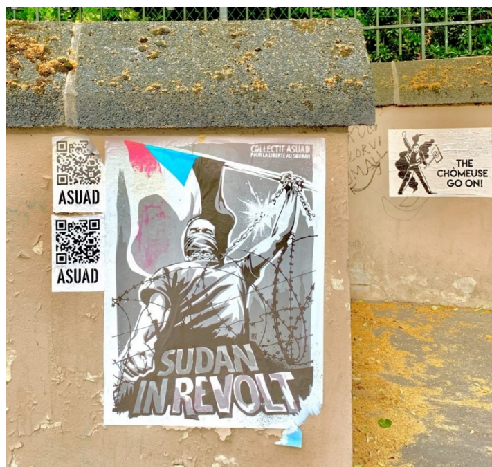
Figure 9. Murals near Ménilmontant Market. These adjacent murals seemingly link the 2018-2019 Sudanese uprising, often called the "Women's Revolution" for female protesters' leading role in overthrowing a 30-year authoritarian regime, with gendered unemployment in Belleville, illustrating how street art connects local and transnational feminist resistance.