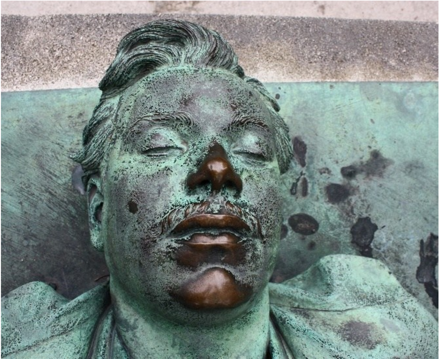
Figure 5. The Tomb of Victor Noir in Père-Lachaise Cemetery. Decades of visitors kissing the bronze sculpture of this radical journalist have polished the lips smooth, creating visible traces of veneration

This dual function of the cemetery, as both pilgrimage destination and tourist site, exemplifies the contested trajectories facing memory-place networks more broadly. The same revolutionary symbols that sustain grassroots commemorations are simultaneously mobilized for heritage tourism, revealing how sedimented memories can serve both democratic memorial practice and memorial commodification depending on the social relationships through which they are activated.