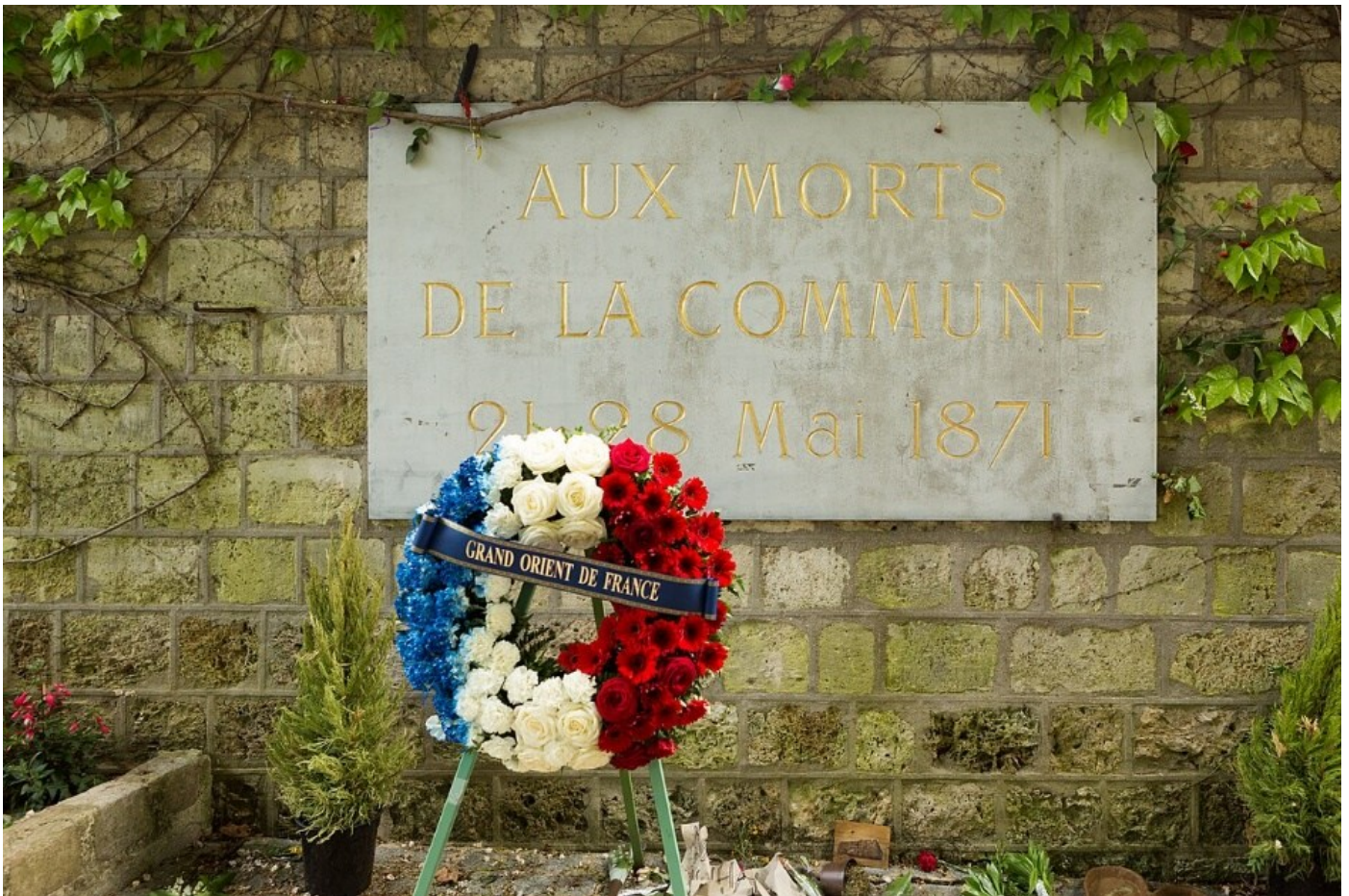
Figure 2. Mur des Fédérés, Père Lachaise Cemetery. The Mur des Fédérés, site of the final Commune executions in May 1871. Annual commemorations and pilgrimages reactivate the site as a ritualized landscape, demonstrating both transnational circulation and processual memory in practice.

Beginning in the early twentieth century, Belleville has been shaped by successive migrations that have left enduring traces in its built environment and everyday life. Armenians, Jews from Eastern Europe and North Africa, Spanish, Kabyles (North African Berbers), Chinese from Wenzhou and later Dongbei, and others established businesses, associations, and places of worship (Simon 1997, 2000, Clerval, Fleury and Humain-Lamoure 2011; Corbille 2013; Beauchemin, Hamel, and Simon 2018). In recent decades these earlier migration flows have been joined by growing North African and Sub-Saharan African populations that now constitute numerically significant communities (Simon 1993; 1997, 2000, 2012; Beauchemin, Lhommeau, & Simon, 2016). The result is what could be described as a palimpsest of overlapping demographies: layers of displacement and settlement that continue to define its streets and institutions. While precise demographic data remain limited due to French restrictions on ethnic data collection (Simon 1998, 2012), available research indicates that immigrant and second-generation residents constitute a substantial and growing portion of the neighborhood's population (Simon 2012; Stott 2015). The neighborhood remains predominantly working-class and lower-middle-class, though accelerating gentrification since the 2000s has brought growing numbers of students and young professionals, contributing to property value increases (Collet 2008; Clerval 2013; Stott 2015).