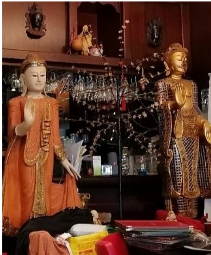
Figure 8. Family Buddhist shrine in Vietnamese restaurant, Belleville. Displays of traditional Buddha statues alongside photographs of the family's 1980s arrival, creates visual layers connecting Buddhist history to migration memory.

as creative space, tourist attraction, and site of memorial negotiation (Figures 10a & 10b). During my fieldwork, I observed how its visual landscape embodies competing temporal relationships to neighborhood change.