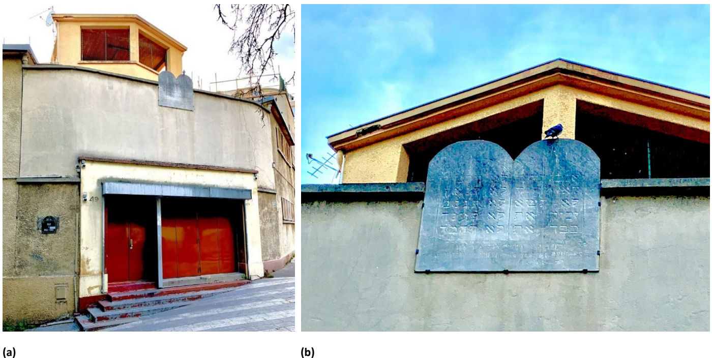
Figure 6. Synagogue Palikao in Belleville (6a & 6b). Inaugurated in 1930 as Paris's first modernist Jewish place of worship, this synagogue became central to Belleville's Tunisian Jewish community following post-war migration from North Africa. The site now hosts both Ashkenazi and Sephardic rites, exemplifying how successive waves of settlement inscribe transnational connections into local sacred space.

If religious and commercial spaces establish durable anchors of multiculturalism, markets and restaurants provide more fluid arenas of everyday encounters. The Marché de Belleville , one of Paris's most famous open-air street markets, amplifies these dynamics (Figure 7). Here, memory-place networks emerge not as static representations but as ongoing, relational enactments of cultural identity (Drivaud and Peretz-Juliard 1984). Beyond economic exchange, market interactions create opportunities for memory sharing as vendors and customers narrate migration stories, compare experiences of displacement, and collectively construct narratives of belonging. Hassan, a Moroccan produce vendor in his 70s who has worked at the market for over thirty years, explained how market conversations help him understand "what it means to be Moroccan in Paris, not just Moroccan at home," while Sophie, a twenty-five-year-old French graduate student who recently moved to Belleville, described learning about North African independence movements through informal exchanges with shopkeepers that "taught me more than university ever did" (personal conversations, May 21, 2019). This aligns with Massey's assertion that places are constituted through "social relations stretched out across space," showing how the market's everyday transactions enact memory-place networks through relational exchange (Massey 2005).