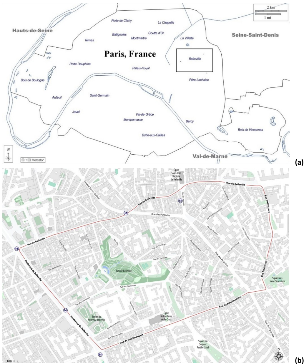
Figure 1. (a) Paris (b) "The Belleville quartier, northeastern Paris."

Belleville, whose name evokes Belle Vue ("beautiful view"), is a quartier situated northeast of central Paris (Figures 1a and 1b). Its steep topography has long marked it as both physically and socially distinct (Clerval 2013; Stott 2015, Hazan 2011). Historically peripheral, existing as an autonomous commune before its 1860 annexation under Haussmann, it over time became a working-class stronghold (Hazan 2011; Campbell 2019). The neighborhood's roles during the Revolution of 1848 and the Paris Commune of 1871 remain central to its memoryscape. During the Commune, Belleville's working-class identity and elevated topography made it both a strategic stronghold and a symbolic heart of Communal resistance against French state forces. The last barricades fell along Rue Ramponeau before defenders made their final stand inside the adjacent Père Lachaise Cemetery. Located at Belleville's southeastern edge, the cemetery became a site of revolutionary martyrdom during the "Semaine sanglante" (bloody week) when 147 Communards were executed at dawn on May 28, 1871, and buried in a mass grave along what became known as the Mur des Fédérés (Wall of the Federalists) (Christiansen 1995; Horne 2007; Merriman 2014) (Figure 2). These sites now serve as destinations for pilgrimages and annual commemorations. Because of these resonances, the study area considered here extends beyond Belleville proper to include Père Lachaise.