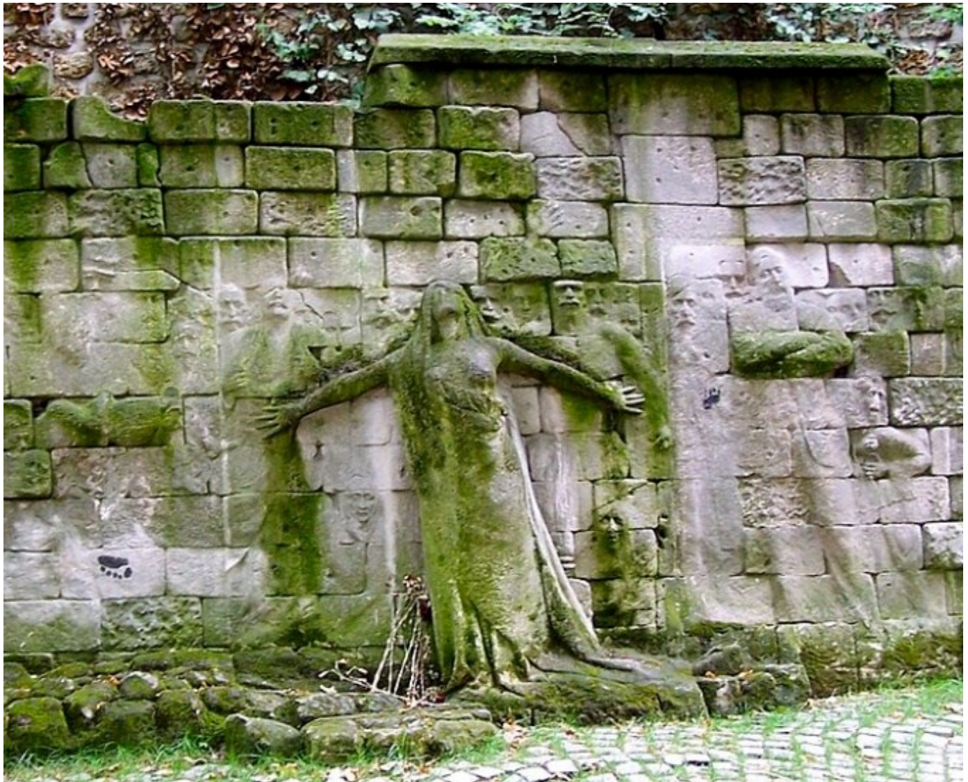
Figure 4. Paul Moreau-Valuthier’s “Victimes des Révolutions (1909): This sculptural work depicts and commemorates victims on both sides of the 1871 conflict. The monument’s inclusive symbolism contrasts with Communard-specific memorials, highlighting Père Lachaise as a heterotopic site where multiple collective memories coexist and are negotiated.

These testimonies demonstrate how participants inscribe new meanings through banners, chants, and symbolic gestures, producing hybrid memorial practices that link local geographies to global movements (Rothberg 2009; De Cesari and Rigney 2014). In this way, the cemetery functions as both an anchor and a conduit in transnational networks of political memory. Its layered traces, ongoing contestations, and ritualized reactivations reveal how the four dimensions of memory-place networks converge in a single heterotopic space. In Belleville and its surroundings, revolutionary memory operates not as static heritage but as a living political resource, continually adapted, circulated, and reinterpreted through contemporary struggles for justice.