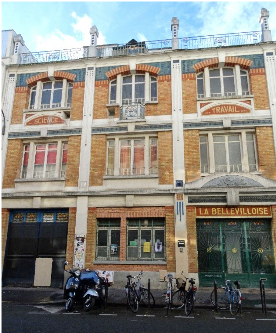
Figure 11. La Bellevilloise cultural venue, Belleville. Originally Paris's first workers' cooperative (1877), now a private cultural venue exemplifying memorial commodification, one that preserves revolutionary heritage as a cultural brand while displacing original cooperative social relations.

The case of La Bellevilloise underscores how memorial heritage can be preserved while stripped of its original social functions. At the same time, moments of negotiated memorial practice show that cultural institutions can open spaces for recognition across difference, even amid gentrification. Together, these transformations highlight how Belleville's cultural memory is selectively packaged within urban redevelopment, shaping who has the right to participate in neighborhood heritage.